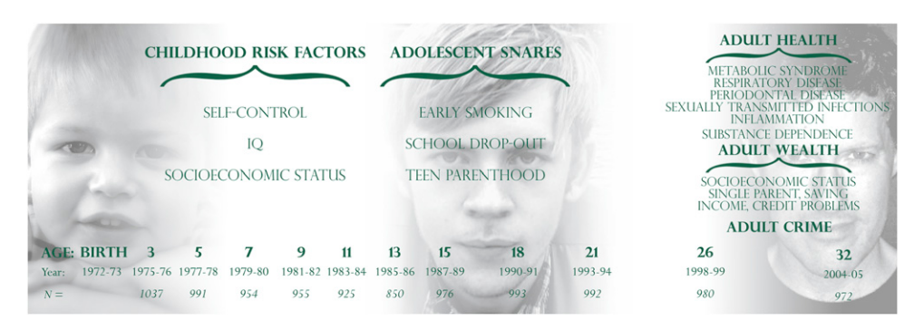
Fig. 1. Design of the Dunedin Multidisciplinary Health and Development Study.

We examined adult health outcomes, such as substance dependence, inflammation, and metabolic abnormalities (e.g., overweight, hypertension, cholesterol), because these are known early-warning signs for costly age-related diseases and premature mortality. We examined wealth outcomes, such as low income, single-parent child rearing, credit problems, and poor saving habits, because these are early warning signs for late-life poverty and financial dependence. We also examined convictions for crime, because crime control poses major costs to government.